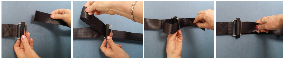
Webbing is threaded through the sliding bar buckle