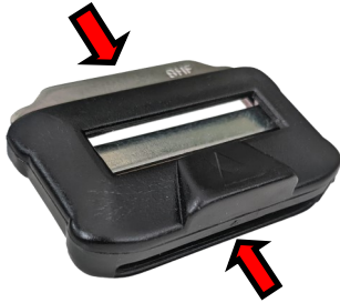
Squeeze Adjuster to release webbing

The 40mm Adjuster is spring loaded to lock the webbing into position. To tighten the strap simply pull the end of the required strap. To loosen squeeze the top and bottom of the adjuster together strap and make the required adjustment.